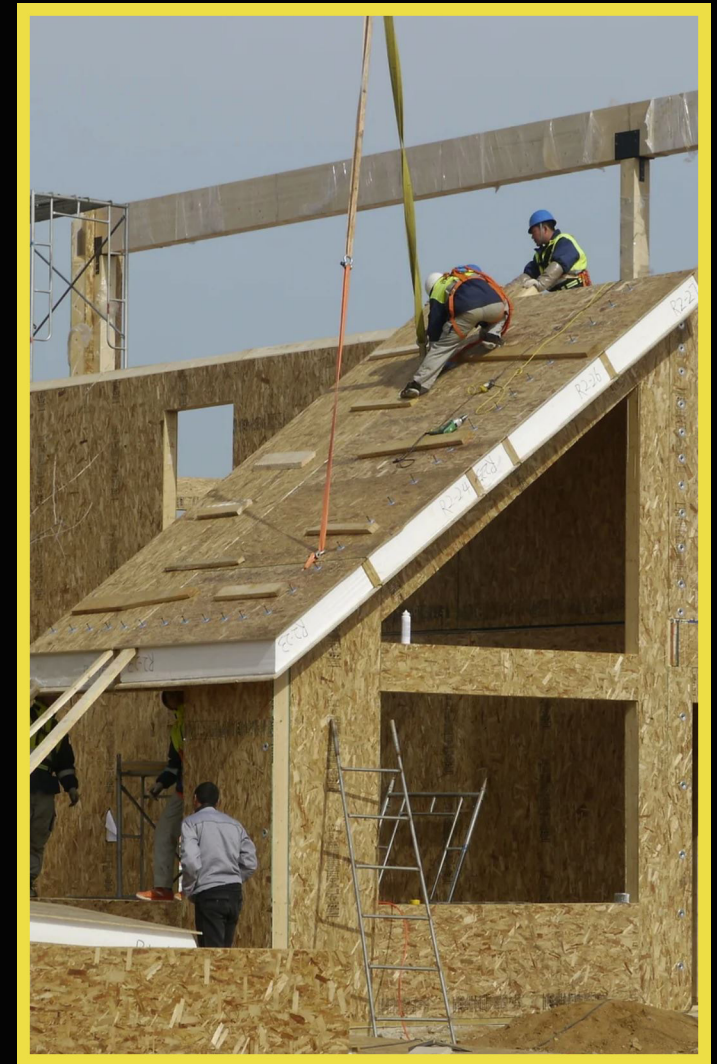
SIPs DURING CONSTRUCTION

Absolutely. Electrical wiring and plumbing can be incorporated into SIPs.